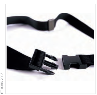
Dräger Saver Waistbelt