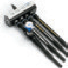
Adapter of the Impactor